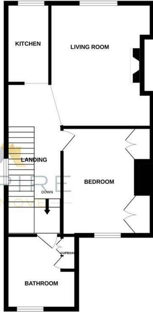
FIRST FLOOR FLAT, 1 BEDROOM

Whilst every attempt has been made to ensure the accuracy of the floorplan contained here, measurements of doors, windows, rooms and any other items are approximate and no responsibility is taken for any error, omission or mis-statement. This plan is for illustrative purposes only and should be used as such by any prospective purchaser. The services, systems and appliances shown have not been tested and no guarantee as to their operability or efficiency can be given. Made with Metropix ©2025